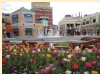
10 Salt Lake City, UT: The Gateway District Revitalization is rejuvenating a 650-acre, blighted industrial district into a mixed-use urban neighborhood with a nexus of transportation modes, a growing employment base, parks, and community-oriented facilities.