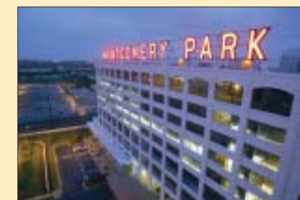
6 Baltimore, MD: The former east coast distribution center for Montgomery Ward is now a 26-acre “green” redevelopment that has leveraged over $60 million in private investment, will generate over 3,000 jobs, and is the new home to the Maryland Department of the Environment.

NALGEP is a nonprofit organization representing the nation’s leading city and county environmental managers. During the past decade, NALGEP has played a major role in shaping brownfields programs and policies at the local, state, and federal levels. NALGEP has led numerous national brownfields research and technical assistance projects, and specializes in communicating technical brownfields concepts to a diverse range of stakeholders in a way that empowers and motivates practitioners to put the ideas into action in their communities.