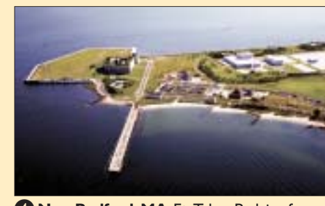
4 New Bedford, MA: Ft. Tabor Park is a former coast guard facility with soil contamination issues. The park was remediated and redeveloped as a coastal city park and state-of-the-art wastewater treatment facility that has significantly reduced nutrient discharges to Buzzards Bay.