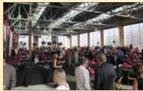
2 Evanston, WY: This rural community of 12,000 is converting a rail facility/roundhouse, built in 1913 by Union Pacific, into a museum and industrial business park to bring higher paying jobs to the area and reconnect sections of the city that have been fragmented by rail operations.