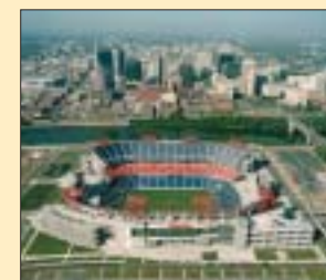
7 Nashville, TN: Nashville Coliseum, home to the NFL’s Tennessee Titans, was built on an industrial brownfields site along the Cumberland River and has sparked the revitalization of Nashville’s waterfront.