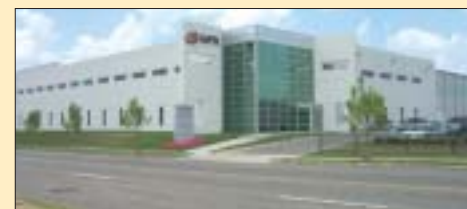
8 St. Louis, MO: The St. Louis Commerce Center is attracting businesses like GPX, Inc., a consumer audio electronics company, with state brownfields tax incentives.