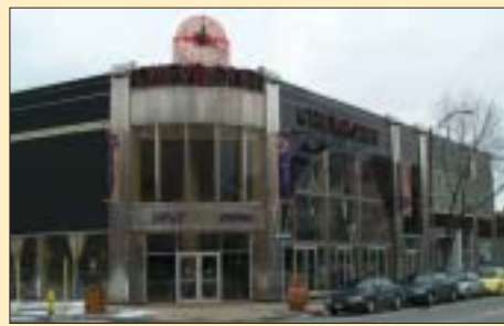
3 Rochester, NY: A former automobile dealership and service garage in downtown Rochester was turned into the Chevy Place coffeehouse and a 77 unit residential development of townhouses and apartments.