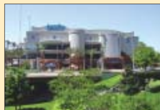
9 Houston, TX: The Downtown Aquarium, a world-class aquatic entertainment, dining, and meeting complex was built on a 7-acre brownfield site that was previously home to Houston’s Fire Station No. 1 and the Central Waterworks plant.