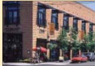
1 Portland, OR: By recycling the long-vacant “Old Carnation Dairy” into a high-density, mixed-use, energy-efficient housing and retail development, Portland and its private partners have helped revitalize the City’s Sunnyside neighborhood and Belmont Business District.